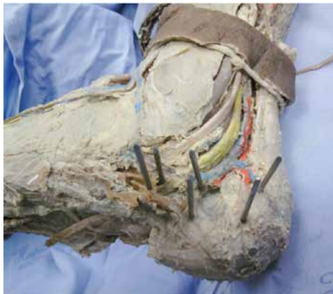
Figure 2 – Photograph of the heel of a cadaver with Kirschner wires coming out of the medial face.

2 and 5 mm, i.e. these were considered to present a moderate risk of injury. Wires located at distances of between 5 and 10 mm were classified as risk grade 1, i.e. they were considered to present minimal risk of injury. Kirschner wires located at distances greater than 10 mm were not considered to present any risk of injury and were classified as risk grade 0 (Table 1).