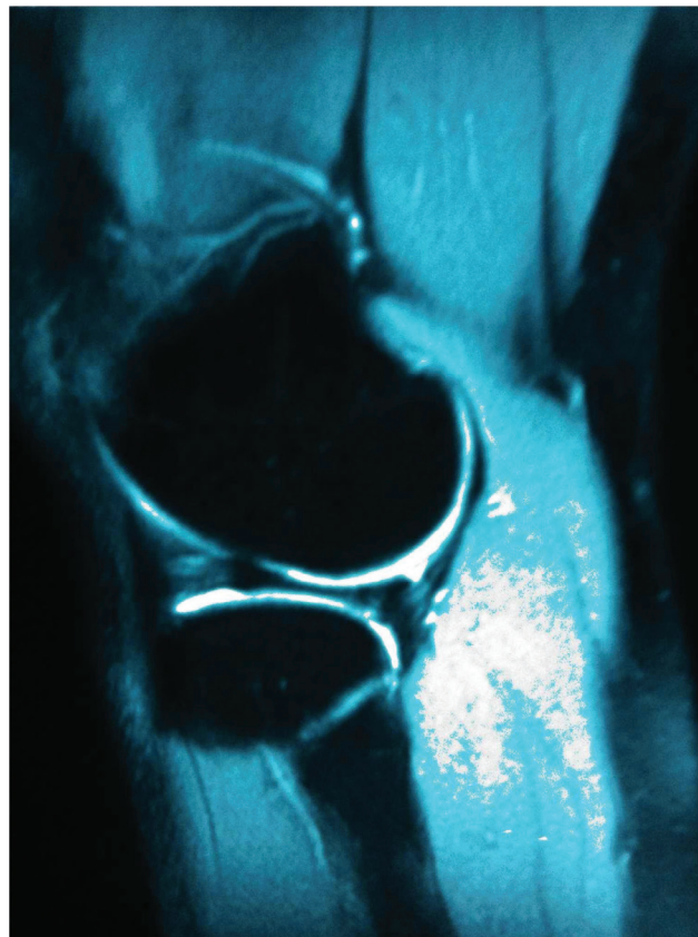
Fig. 4 - NMR on the right knee, one year after conservative treatment, with spontaneous resolution of the bucket handle tear seen in a transverse slice.