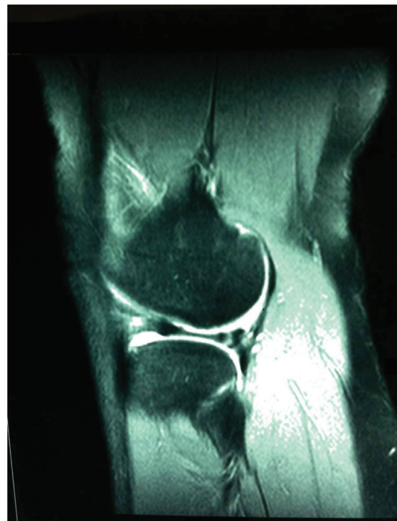
Fig. 1 - NMR on the right knee, showing the bucket handle tear in a longitudinal slice.

Lachman test (grade III) and subluxation with crackling in the pivot shift test. NMR showed a bucket handle tear of the medial meniscus, with displacement of the fragment into the intercondylar region, tearing of the lateral meniscus, joint effusion, grade II femoropatellar chondropathy and ACL tearing (Figs. 1 and 2).