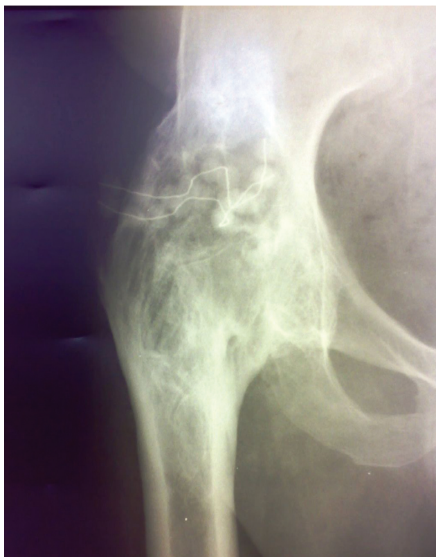
Fig. 5 A plain radiograph of the right hip showing the containment of the gentamicin beads.

cases per 100 thousand inhabitants/year. The most common route of entry into the joint is hematogenous spread during bacteremia. Pathogens may also enter through direct inoculation (for example: arthrocentesis, arthroscopy, trauma) or spread continuously due to local infections (such as osteomyelitis, septic bursitis, abscess). 1