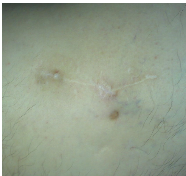
Fig. 4 Postoperative scar in the region of the great trochanter without fistula and redness.

the results of the intervention. He walked with a limp wearing orthopedic shoes, without using crutches or any other type of walking aid. As we care greatly for our patients, we honored our patient's autonomy to decide, and subsequently referred him for conservative management and follow-up. Four years after the surgical intervention, the gentamicin chain beads are still within the bone (► Figs. 4 and 5 ). No side effects such as redness, swelling, heat, ototoxicity, or nephrotoxicity have been reported.