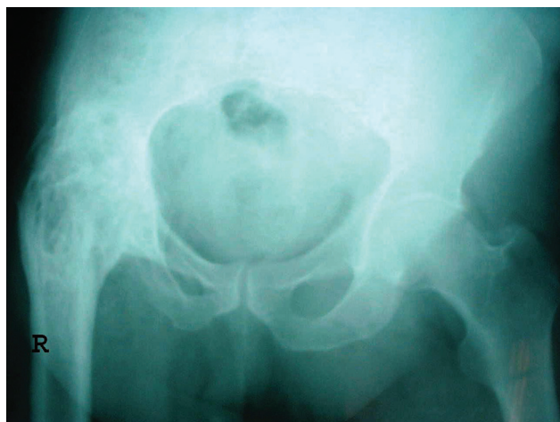
Fig. 2 Simple radiography of the pelvis, showing ankylosis of the right hip.

He reported having no history of pain and fever. The movements of the right hip joint were limited to 30° of flexion, 10° of abduction, and no rotation. The patient limped while walking due to a shortening of the leg of ~ 5 cm. According to his life history, at the age of 12, he suffered blunt trauma from a crash. For 58 consecutive years, the patient reports that the fistula has been present on his limb, secreting pus. Upon admission to the hospital, plain radiography and X-ray fistulography revealed a focus of infection focus in the femoral epiphysis (► Fig. 2 ).