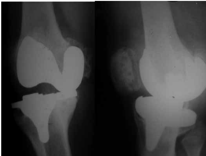
Figure 1- Preoperative radiograph of case 1.

fracture in the tibial component (Figure 1). TKA revision surgery was indicated, and this was performed in August 2009 (Figures 2 and 3). During the immediate postoperative period, we observed pain relief and functional improvement of the knee.