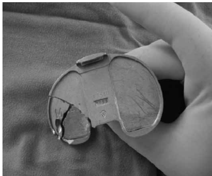
Figure 3- Fracture of the tibial component of case 1.

The patient was a 72-year-old man with normal body mass index, who presented osteoarthritis and underwent total arthroplasty on the left knee in January 1994, at a private hospital in the state of Rio de Janeiro. The PCA prosthesis model was used (Howmedica®). The patient underwent successive revisions with the physician responsible for this, but