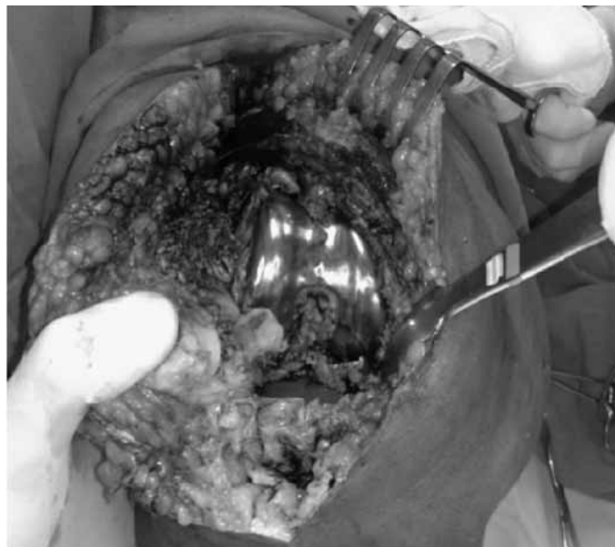
Figure 2 – Intraoperative view of case 1.