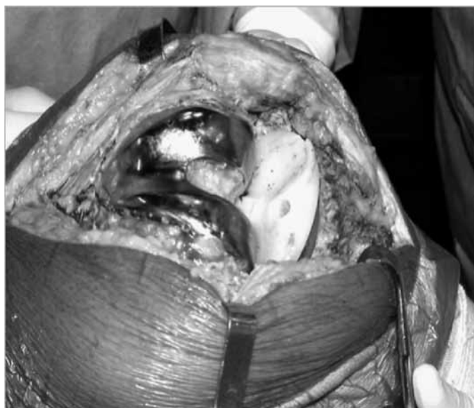
Figure 5 – Intraoperative view of case 2.

ligament balance, appropriate precision instruments and a good-quality durable implant.