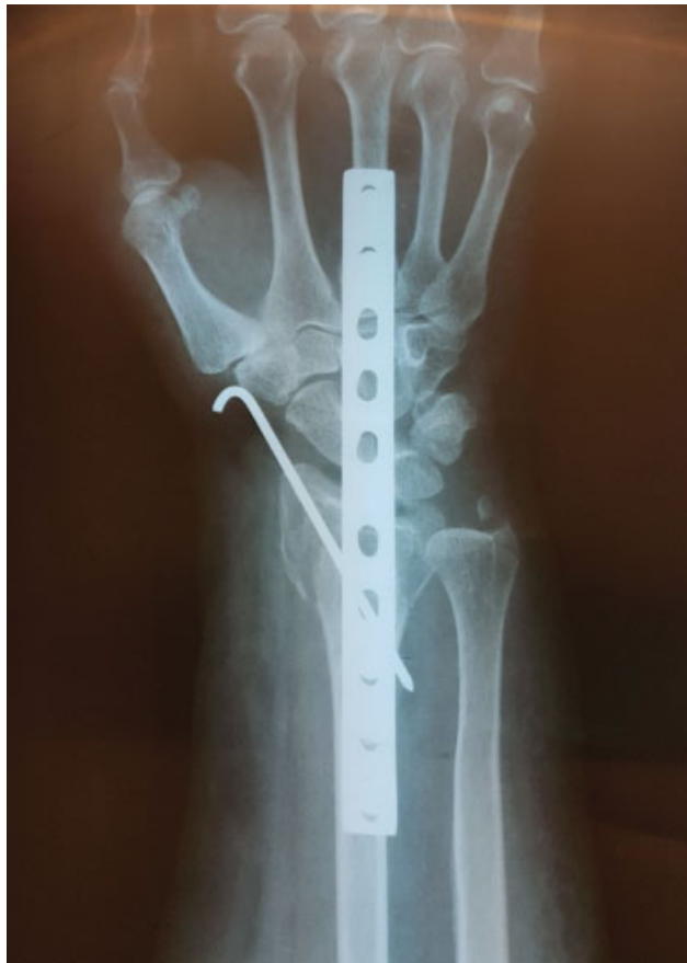
Fig. 3 Postoperative radiograph of a patient with a dorsal bridge plate.

All patients received an intraoperative antibiotic agent (cefazolin), in addition to an oral prophylactic antibiotic agent (cephalexin) for 10 days.