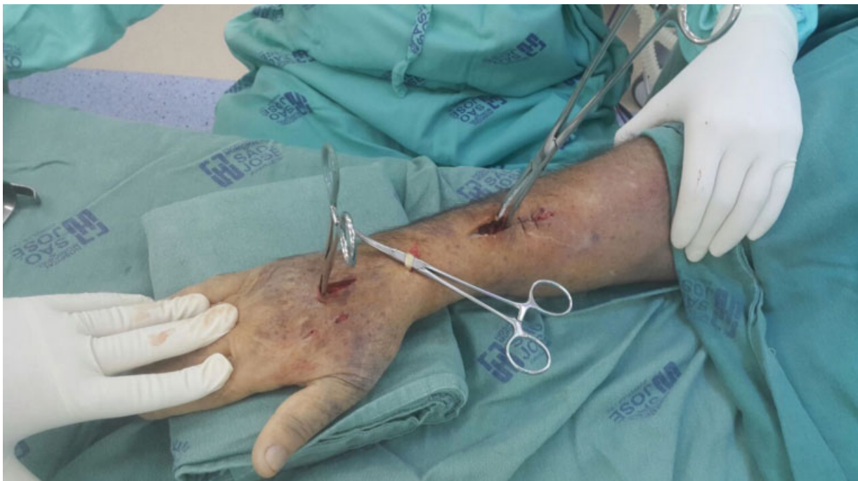
Fig. 2 Intraoperative image of the bridge plate technique.

A dynamic compression plate (DCP) was placed juxta-ossously, moving the long extensor tendon of the thumb at the third tunnel through an access of approximately 3 cm in the Lister tubercle. The plate was passed below the extensor tunnels, and an access was made to isolate the long extensor tendon of the thumb and to make sure that the plate was below the tendons. Fixation was performed with two distal screws, followed by fracture reduction and fixation with two proximal screws. A synthesis with Kirschner wires was also performed if required (► Figure 3 ).