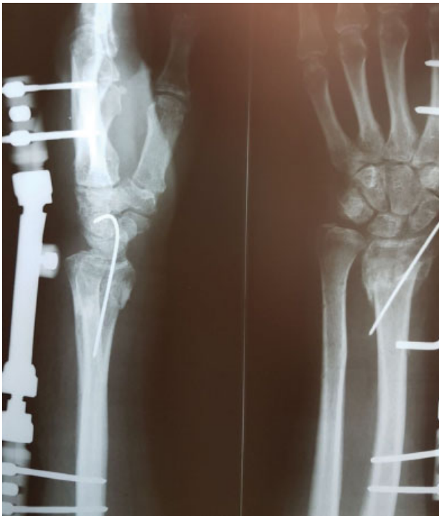
Fig. 1 Postoperative radiograph of a patient with an external fixator.

The patients were recruited from December 2017 to May 2018 during outpatient return visits at Hospital Municipal São José, in which the surgical treatment was performed, always by the same hand surgeon, who is the chief physician. Patients with associated fractures in the same limb, open distal radial fractures, previous deformities and/or those requiring care at an intensive care unit were excluded from the study.