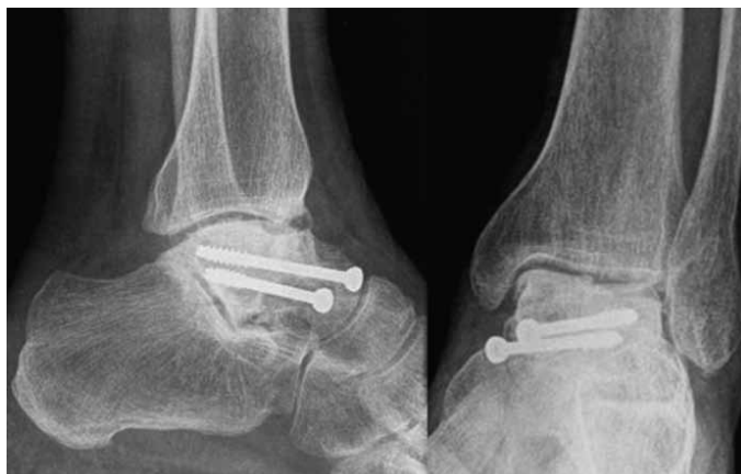
Figure 2 – Preoperative radiographs of the left ankle.

At the most recent follow-up consultation (12