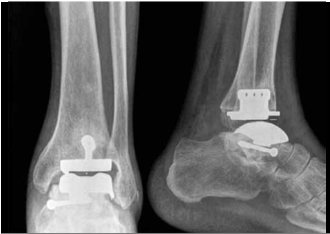
Figure 3 – Radiographs after 12 months of follow-up.