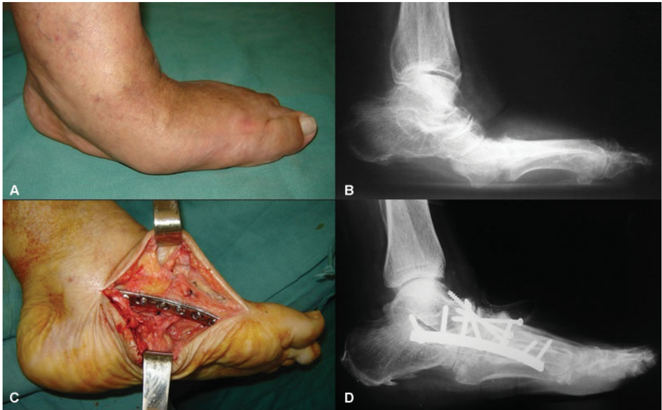
Fig. 1 Clinical aspect (A) and radiographic image of a patient with Charcot neuroarthropathy, in lateral view of the left foot, with a support base (B), affecting the midfoot (type I of the anatomical classification of Brodsky 4 and Trepman 22 ). Note the pronounced abduction deformity (A) and severe collapse of the arch with plantar bony prominence (A and B). Surgical treatment consisted of modeling midfoot arthrodesis through medial approach for bone wedge resection and correction of deformities (C), followed by internal fixation with plate and screws (D).

to fix osteopenic bones in the medial spine of the foot (→ Figure 1 ); 2) Cannulated headless screws for longitudinal fixation through midfoot bones ( intramedullar beaming ) (→ Figure 2 ); 3) intramedullary nail blocked for hindfoot (→ Figure 3 ); 4) plates with locking screws specially designed for fixation of the hindfoot. It is extremely important to emphasize that the use of internal fixation does not, in any way, discard the long-term use of TCC. Plaster immobilization should be maintained until clear and unambiguous signs of complete bone healing of the arthrodesis are identified on radiographic images taken during outpatient follow-up. In the presence of bone contamination due to chronic ulceration, the recommended bone fixation, during the modeling arthrodesis, is restricted to the circular external fixator. 20,34,39,43