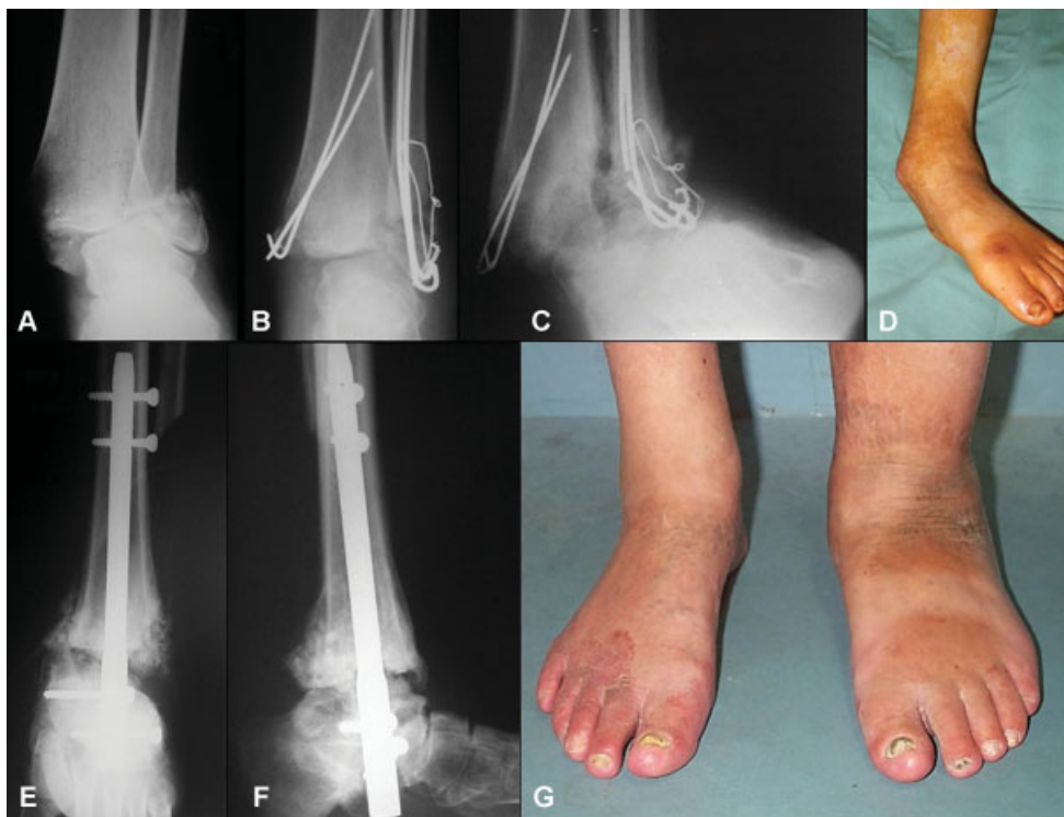
Fig. 3 Anteroposterior radiographic aspect of the left ankle showing unstable bimalleolar fracture (A), initially treated with open reduction followed by internal fixation by cerclage (B). During the postoperative follow-up, typical osteoarticular destruction of Charcot neuroarthropathy type IIIa, according to the anatomical classification of Brodsky 4 and Trepman, 22 occurred (C). Clinical aspect shows major ankle valgus deviation (D). Modeling tibiotalar calcaneal arthrodesis was indicated both to correct deformity and to stabilize the hindfoot. Radiographic images of the ankle, carried out with a support base, show that both in the anteroposterior (E) and lateral (F) incidences, bone healing of arthrodesis is ongoing. Proper alignment and stability for support could be achieved, as the clinical image demonstrates (G).