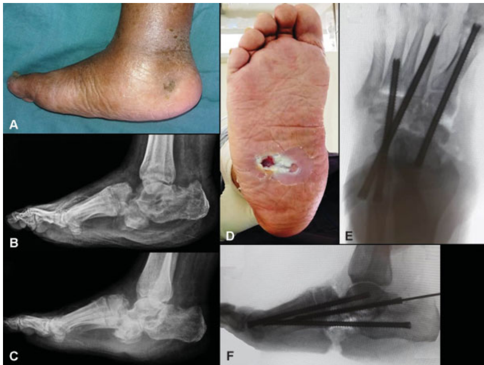
Fig. 2 Clinical aspect (A and D) of the right foot in a patient with Charcot neuroarthropathy affecting the midfoot. Radiographic images of the lateral view of the foot and ankle show that this is a type II lesion, according to the anatomical classification of de Brodsky 4 and Trepman 22 (B and C). Both upon patient arrival (B) and 4 months after the start of treatment with total contact casting (C), we can observe the presence of a pressure ulcer (D) caused by cuboid plantar bony prominence (C). The surgical treatment consisted of complete resection of the cuboid, followed by modeling midfoot arthrodesis using screws for internal fixation, according to the intramedullary beaming technique (E and F).