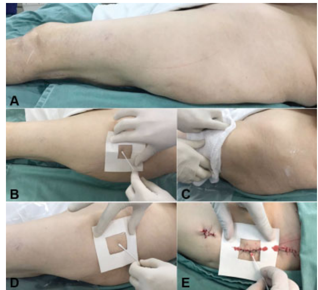
Fig. 1 Figures showing the time of sample collection. (A) Patient under anesthesia, with the surgical limb isolated with drapes; (B) sample collected before skin preparation; (C) skin preparation with chlorhexidine-based soap and excess removal; (D) sample collected after skin preparation; (E) sample collected at the end of the surgery, after surgical wound closure, with the patient still in the sterile environment.

After 48 hours of culture, the culture media were evaluated for organism growth. In case of growth, the number of colonies was counted, and Gram-positive ( Staphylococcus aureus and non- aureus ) and Gram-negative bacteria were identified. Samples from all time points, in both the mannitol and EMB media, were evaluated to verify if the number of colonies had decreased, increased or remained unaltered