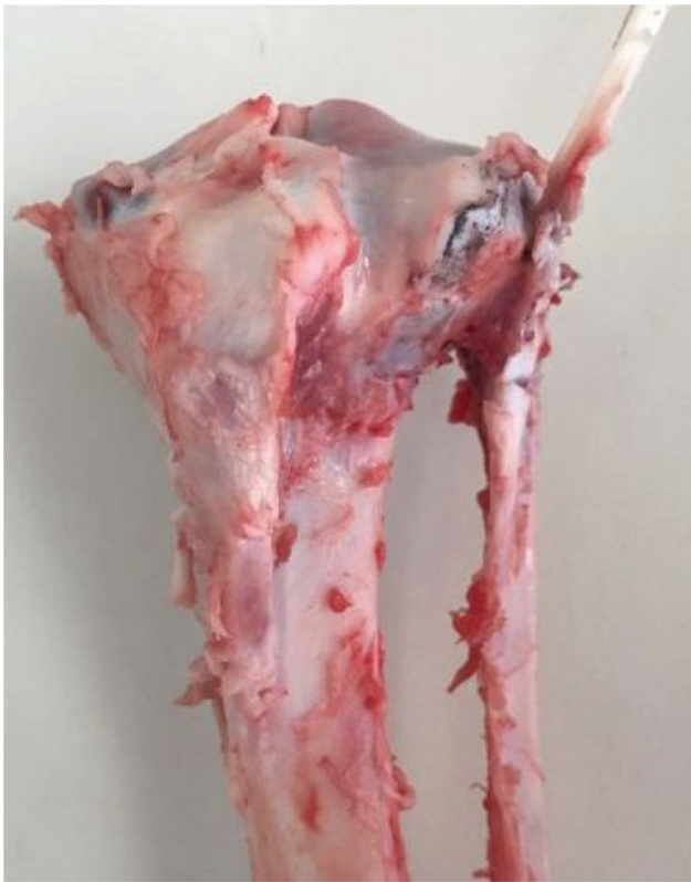
Fig. 1 Tibia preparation.