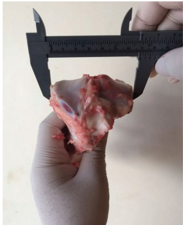
Fig. 3 Plateau width.

Tendon graft fixed with a 5 mm anchor and 5 surgical knots 19 with Ultrabraid wire – Pauchet technique – and