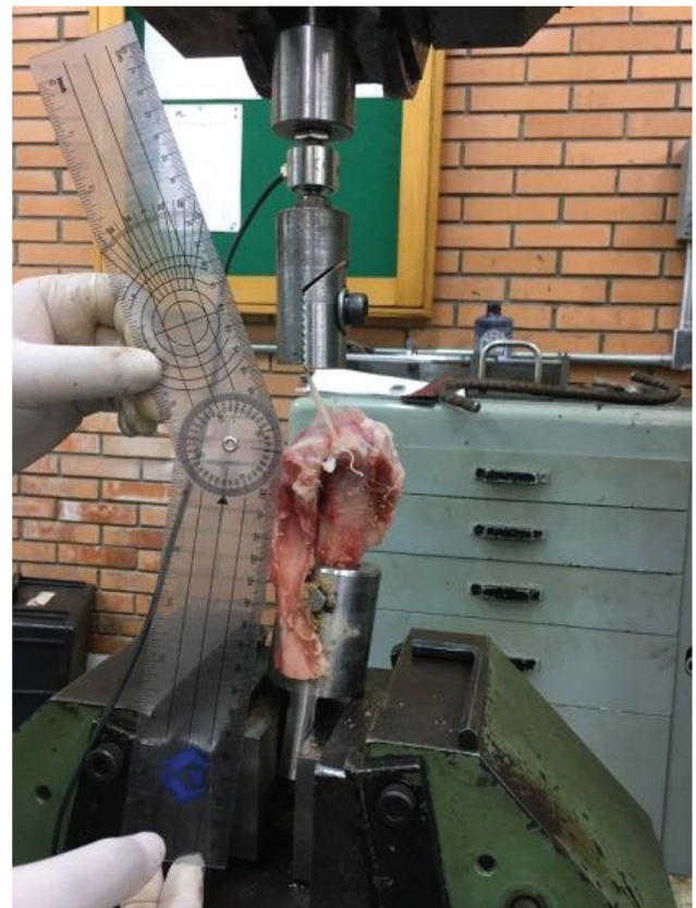
Fig. 5 Tibia position during tests.

The sample size was determined from data from previous studies. 9,21,22 The tensile strength was compared between groups with an F test (analysis of variance [ANOVA]) with multiple size comparisons. Data normality and equality of variances hypothesis were respectively determined by the