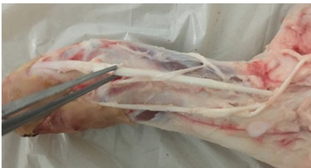
Fig. 2 Graft preparation.