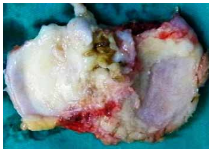
Figure 3 – Preoperative view of excised tibial plateau.