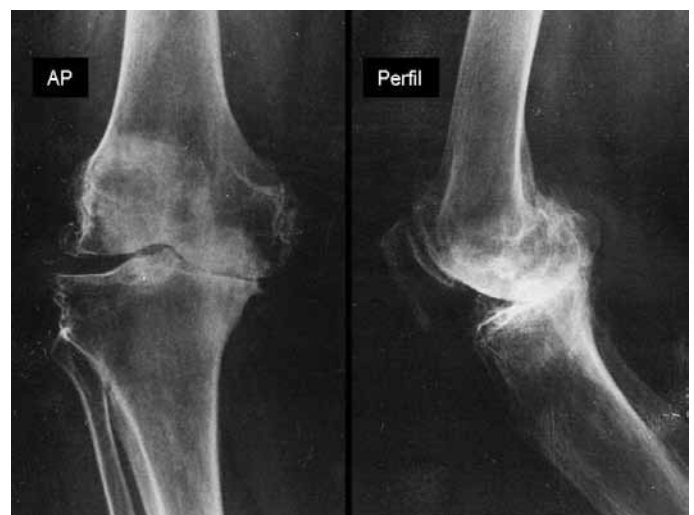
Figure 1 – Right knee radiograph, anteroposterior (AP) and lateral (Perfil) views.

The knee radiographs, anteroposterior and lateral views were obtained according to the standard protocol described. Radiograph of the knee in the anteroposterior projection (AP) with one-foot support (5) , the beam was centered on the inferior pole of the patella and the film-to-distance was 1 meter. For the lateral view of the knee, the patient was placed in lateral decubitus on the affected side of the knee, with knee flexion of 20°, measured with a goniometer (7) . The central ray was directed vertically to the medial knee joint with head angulation of 5° and a tube-film distance of 1m. The radiographic image of the medial tibial plateau was distinguished from the lateral view by the method described by Jacobsen (13) . All radiographs were performed in the same radiology department (Figure 1).