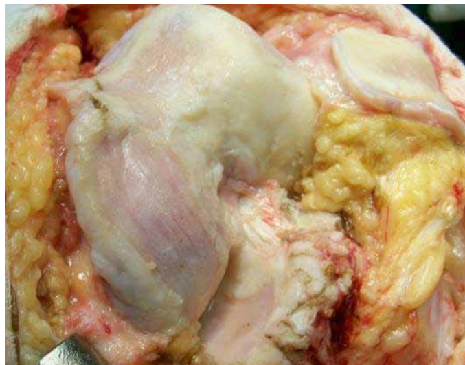
Figure 2 – Preoperative view of the left knee.

Grade 4b – penetration throughout the entire diameter of defect