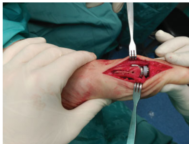
Fig. 1 Intraoperative photograph of 1MTP replacement showing correct fit of the implants.

For 1MTP arthroplasty, the same prosthesis was used (Metis, Newdeal SA Integra Lifesciences ILS, Plainsboro Township, NJ, USA). This is a 3-component, noncemented hydroxapatite coated, nonrestrictive, titanium modular prosthesis. A medial incision was made from the middle of the phalanx to the middle of the metatarsal to expose the first metatarsal-phalangeal joint. To prepare the articular surfaces, the osteophytes and cartilage were removed and a bunionectomy (when necessary) was performed. After determining the size of the metatarsal component, the metatarsus was cut using a metatarsal cutting guide and the implant was tested. Importantly, whenever the patient had index plus, the metatarsal cut was performed to reduce its length to the same length of the second metatarsal (index plus minus). The phalanx was then prepared with reamers and the appropriate sized implant was chosen and tested.