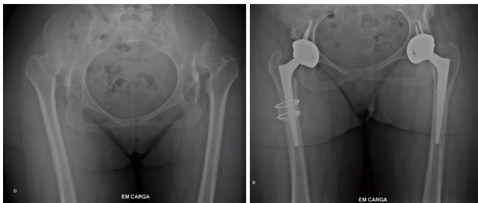
Fig. 2 – Example of patient MMMM. Radiographs before and after arthroplasties due to bilateral high dislocation.