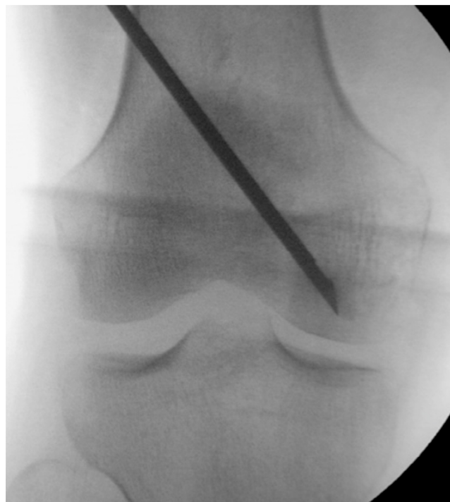
Fig. 2 – Image of intraoperative radioscopy, with cannula positioning in a lesion mapped using magnetic resonance imaging.

After mapping, patients underwent the subchondroplasty procedure, which was performed under spinal anesthesia, in an operating room, after conventional prepping techniques. Patients were placed on dorsal positioning on a radiolucent table, with a cushion under the ipsilateral hip for better control of the external rotation of the limb. Another cushion was also positioned under the knee to be operated, aiding in the lateral incidence of fluoroscopy and avoiding an overlap with the image of the contralateral knee. According to preoperative planning, the cannula entry point was demarcated with the aid of fluoroscopy in front and profile views. The cannula was