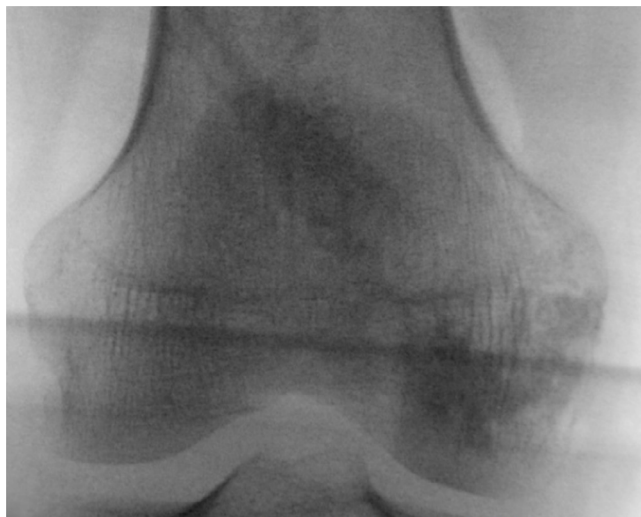
Fig. 3 – Image of intraoperative radioscopy, with radiopacity after filling by subchondroplasty, in a region mapped using magnetic resonance imaging.

Five patients were prospectively evaluated, four females and one male, with a mean of 67.7 ( \pm 9.67 ) years; they presented pain in one knee for at least six months, after a minimum of three months of conservative treatment without improvement. All patients had a MRI scan with a hypercapitating lesion in T2-weighted fat-suppression images in the subchondral region of the tibial plateau or femoral condyles.