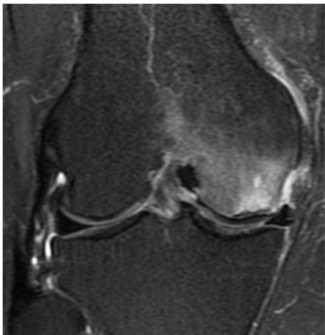
Fig. 1 – Bone medullary lesion in medial femoral condyle, with hypersignal on T2-weighted magnetic resonance image.

The exclusion criteria were: autoimmune diseases, renal disease requiring dialysis, osteoarthritis radiographically classified in the Kellgren–Lawrence system 18 as greater than grade 3, diversion of the mechanical alignment of the lower limbs larger than 8 degrees, or radiographic alterations of the patellofemoral joint associated with symptoms of anterior pain in the knee.