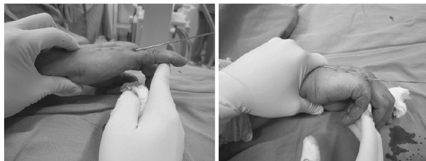
Fig. 4 – Mobility of the metacarpophalangeal joint without loss of reduction.

metacarpals present subcutaneous locations on the dorsum of the hand (Fig. 3). Maintaining the wire in this position enabled metacarpophalangeal joint mobility without loss of the reduction, which facilitated evaluation of the possible rotational