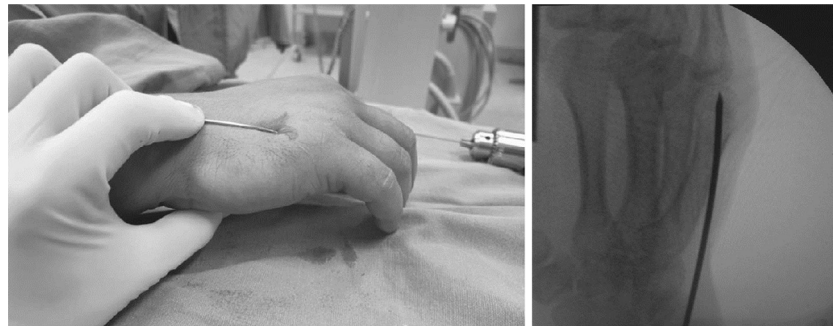
Fig. 3 – Reduction of the fracture.