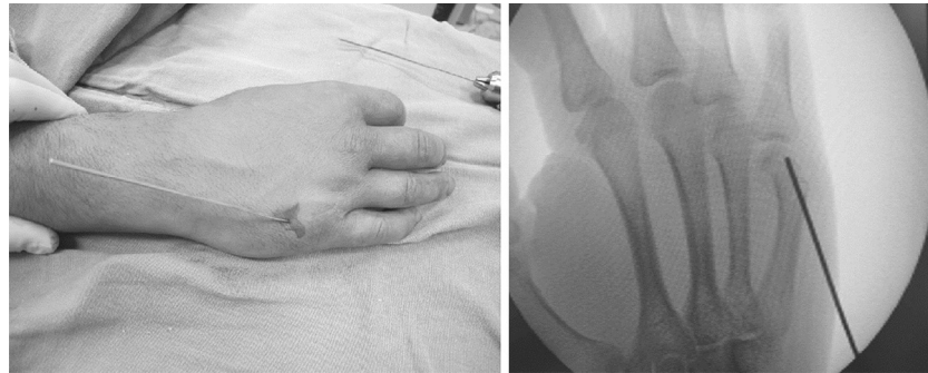
Fig. 2 – Introduction of the intrafocal wire. Position confirmed by means of radioscopy.