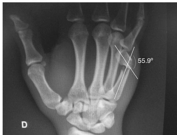
Fig. 1 – Measurement of fracture displacement angle.

Between September and October 2012, ten patients with neck fractures of the fifth metacarpal were treated surgically using the technique described, and the radiographic results were