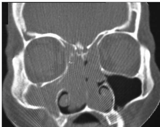
Figure 1. Nasal cavity and paranasal sinuses CT scan. Coronal cross-section, showing the bilateral involvement of nasal cavities, ethmoidal sinuses and right maxillary sinus.

The patient was then submitted to nasosinusal