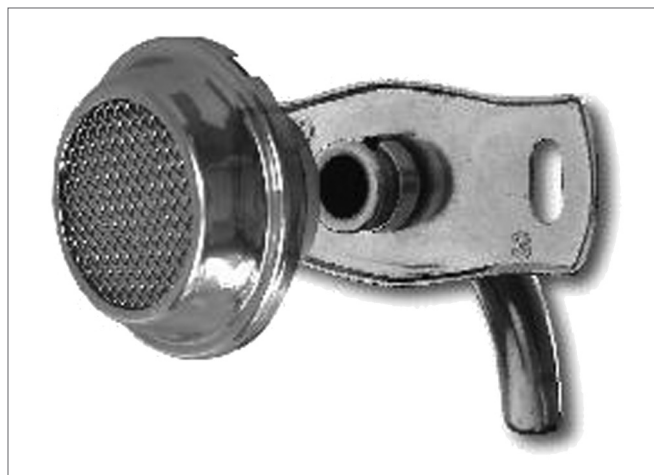
Figure 1. Speaking valve coupled to the metal cannula.

The speaking valve developed for this study contains a diaphragm, a filter and plastic connections mounted within a stainless steel body (Fig. 1). It may be adapted to all Brazilian metal cannulae (Fig. 2) by an anterograde route on a dock in the speaking valve adaptor connected to the headpiece of the internal tracheostomy cannula. It has an adaptor for all tracheostomy cannulae numbers. Forty, 50 and 50 Shore (valve opening hardness) diaphragms were tested; the 40 Shore diaphragm offers the least resistance to opening. All patients started with 50 Shore valves; after the first week, and according to the difficulty in inhaling, patients could change to 40 Shore diaphragms; otherwise if air was escaping, a 60 Shore diaphragm was placed. All patients were assessed weekly during the first month to assess the comfort of using the valve and to set the best valve hardness for each patient; this was done using a specific questionnaire to verify speaking without