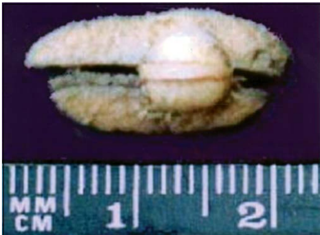
Figure 1. Aspect of cutaneous nodule removed from the dermis of submandibular region (2nd lesion).

parotid, we can consider the following diagnostic hypotheses for differential diagnosis: 1) metastasis of breast ductal carcinoma owing to the presence of apocrine differentiation that may take place in the tumor, in addition to the fact that the breast is a frequent site of primary tumor in infraclavicular anatomical location, generating metastases to the parotid 7,8 ; 2) metastasis of cutaneous apocrine carcinoma that has marked apocrine differentiation 5-7 ; 3) salivary gland ductal carcinoma, whose basic aspect is to have some similarities such as the fact that neoplastic cells present abundant eosinophilic and granular cytoplasm, with increased nuclei and prominent nucleoli, forming micropapillary arrangements or comedo-necrosis foci 9,10 ; and 4) renal cancer metastases, in which neoplastic cells also have abundant eosinophilic and granular cytoplasm, which can also present areas of papillary differentiation 7,8 .