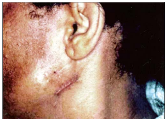
Figure 2. Small tumor in parotid region (3rd lesion). We can also observe the surgical scars of previous lesions removed.