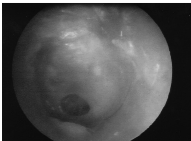
Figure 1. Central perforation in the tympanic membrane.

With the patient under general anesthesia and under microscopic view, we examined the tympanic membrane perforation (Fig.1). The perforation border was removed with a straight tip stylet and, later on, a curved tip stylet was used to scratch the mucosal face of the tympanic membrane. The perforation's size and shape were measured with the help of a hook-type stylet, drawing its shape in a piece of sterile paper (nylon suture wire wrapping which was used later to close the tragal incision -donor site). The paper was cut and the perforation size was checked against the paper mold created.