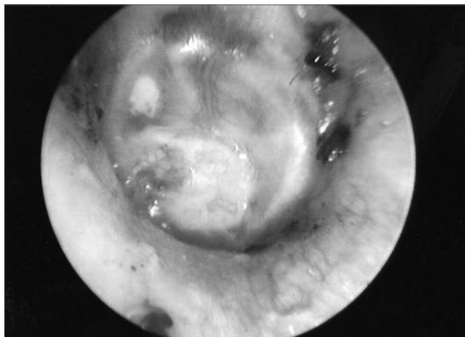
Figure 4. Otoscopic view one week after surgery.