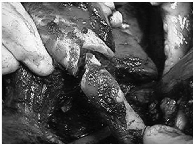
Figure 2. Osteosynthesis using titanium miniplates.