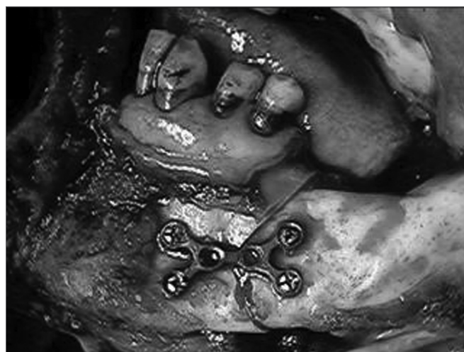
Figure 1. Mandibulotomy associated with marginal mandibulectomy in tonsillar region lesions.

The series was divided into two groups. The first group contained 20 patients that were treated by marginal resection of the mandibular bone. Fourteen of these patients were stage T4a and 6 patients were stage T4b. The second group (control group) consisted of 22 patients treated by segmental resection of the mandibular bone. Fifteen of these patients were T4a and 7 were T4b. All of the patients underwent neck dissection; reconstruction was done by primary closure in 38 patients and by a pectoralis major myocutaneous flap in 4 patients. All of the patients underwent postoperative radiotherapy since these were advanced tumors and/or presented neck metastases. No patients were treated with preoperative or postoperative chemotherapy. In patients treated by marginal mandibulectomy the procedure started with a paramedian access mandibulotomy, angled below the emergence of the mentonian nerve. Marginal mandibulectomy was done from the body of the mandible to the coronoid apophysis above the mandibular canal (Figure 1).