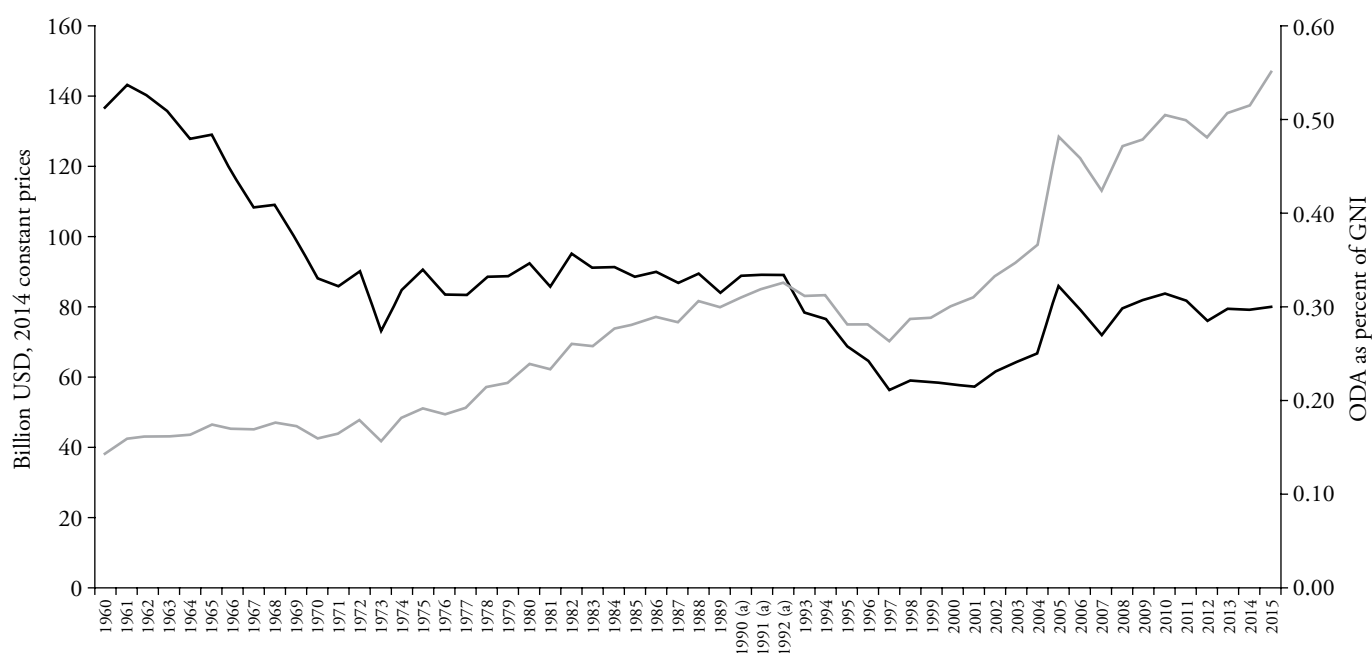
Figure 1. Trends in ODA 1960-2015

For 1990, 1991 and 1992: total DAC excluded debt forgiveness of non-ODA claims