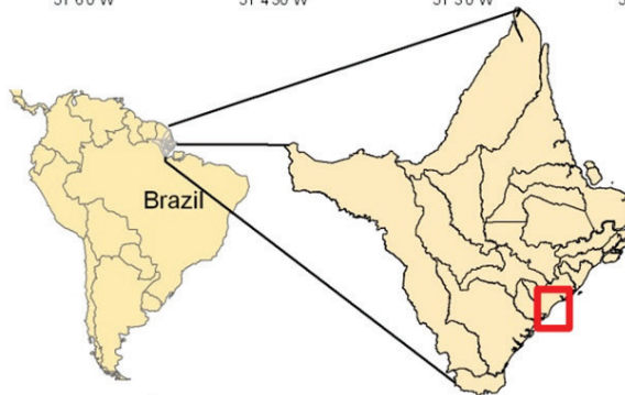
Figure 1. Collection localities of native Cichlidae species and Oreochromis niloticus in the Igarapé Fortaleza basin, eastern Amazon, Brazil.