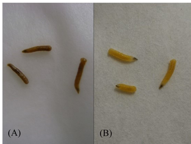
Figure 2. Alteration of color and appearance of Stomoxys calcitrans larvae caused by infection by EPNs of the genus Heterorhabditis . (A) dead larvae after the attack from EPNs; (B) live larvae of the control group.

The appearance of fly larvae in the groups treated with Heterorhabditis (Figure 2) is in accordance with Kaya & Gaugler's (1993) description. The dead larvae showed coloration tending