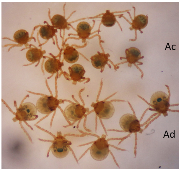
Figure 1. Unfed larvae of Amblyomma cajennense (Ac) and Amblyomma dubitatum (Ad) under a stereoscope microscope. Note larger size of A. dubitatum larvae.

*different superscript italic letters in the same line mean significantly different proportions of A. cajennense and A. dubitatum adult ticks in the area. †refers to the proportion (%) of each tick species according to the total number of larvae, nymphs or adults.