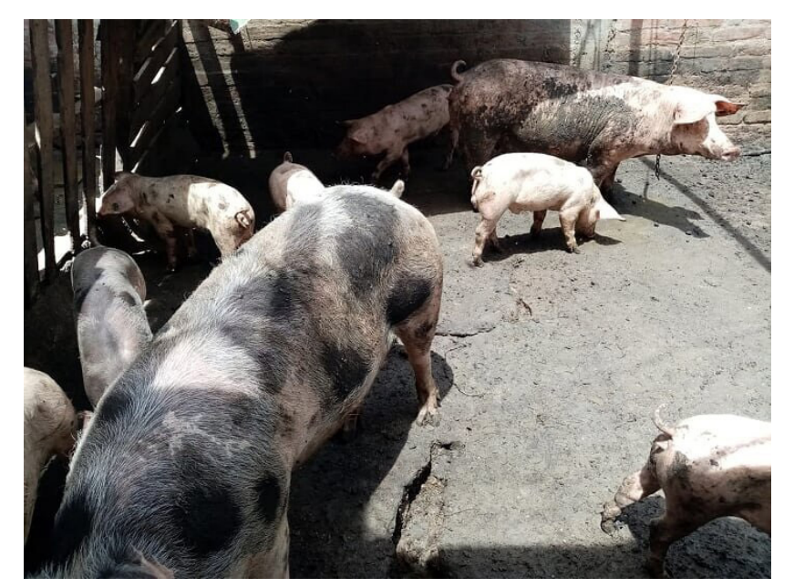
Figure 1. Backyard pigs group raised in open-air pens on farms located at the Bucaramanga Metropolitan Area, department of Santander, Colombia.