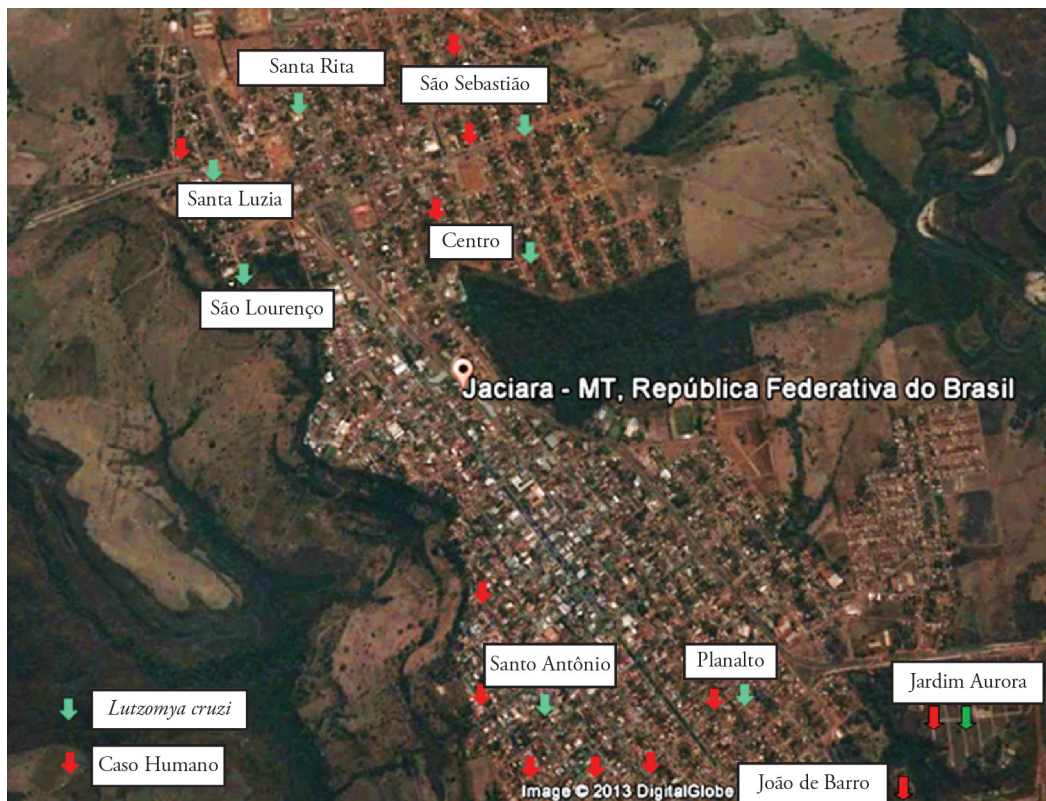
Figure 2. Spatial distribution of L. cruzi according to district surveyed in entomological monitoring and human cases that occurred in the municipality of Jaciara, Mato Grosso, Brazil, 2003-2012.