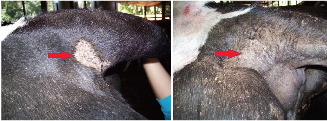
Figure 1. Clinical appearance of chorioptic mange in cattle (arrows) in the northeastern mesoregion of the state of Rio Grande do Sul, Brazil.

Macroscopic analysis on the skin fragment showed an irregular surface with crusts and with a grayish-brown to chestnut-brown color. At the time when the material for sections was collected, the skin fragment was grayish-white in color with a stiff consistency. Microscopic analysis revealed severe multifocal subacute eosinophilic lymphoplasmacytic perifolliculitis; moderate-to-severe multifocal subacute, sometimes suppurative, eosinophilic dermatitis; and mild multifocal suppurative folliculitis, with the presence of intraluminal mites in the follicles. Hyperkeratosis with crusting and microabscesses, bacterial colonies and some mites were also observed, along with hemorrhage, thus suggesting the presence of a chronic lesion. Histopathological analysis constitutes an important tool for diagnosing chorioptic mange, based on previous studies. The histopathological findings of this study were similar to those previously reported in case of Chorioptes infestations (HESTVIK et al., 2007). Consequently, since secondary bacterial infections were found in the integumentary system of cattle, in wounds induced by C. bovis , we concluded that this mite facilitated this type of secondary infection. Moreover, although the treatment of C. bovis was effective, lesions remained present. Thus, we also concluded that secondary infection contributes to the chronic nature of the injury.