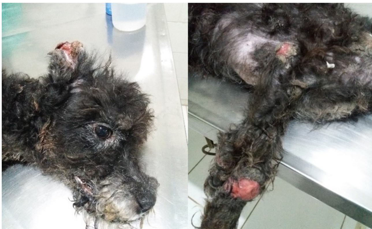
Figure 3. Dog CG06 after failure of treatment with miltefosine.