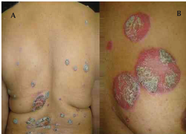
Figure 2 Plaque psoriasis. A: Involvement of the dorsum. B: Erythematous and scaling plaques in the left breast.