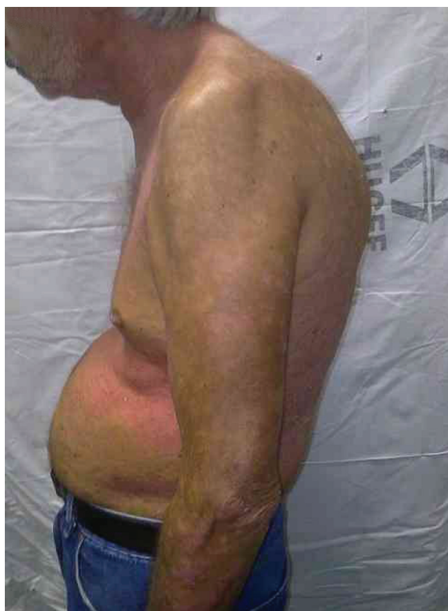
Figure 1 Spondylitic form of psoriatic arthritis. Note straightening of the lumbar spine and marked dorsal kyphosis, in addition to erythematous lesions of psoriasis.

The inflammatory lesions of psoriasis are usually chronic and recurring, although they might also begin suddenly.