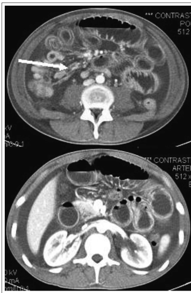
Figure 2 - Abdominal CT. Intestinal loop edema with “double halo” sign and intestinal pneumatosis