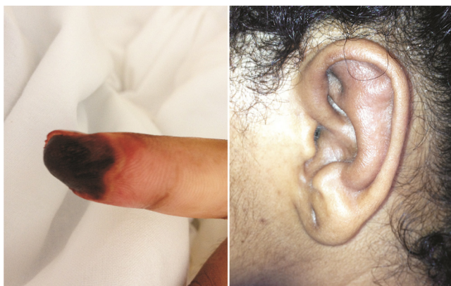
Fig. 1 – Left, vasculitic injury in 2nd right chirodactyl. Right, edema in the pinna, sparing the ear lobe.

Complementary tests showed normocytic and normochromic anemia (hemoglobin 7.9 g/dL), leukocytosis of 16,000/mm 3 without shift, and elevation of inflammatory markers: C-reactive protein (CRP 196 mg/L), erythrocyte