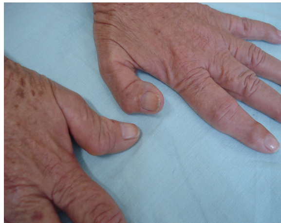
Fig. 1 – Bilateral subluxation of distal interphalangeal joints (case 2).

In 2007, due to a respiratory and laboratory worsening, a monthly pulse therapy with cyclophosphamide was initiated. In that very year, she had a synovitis at the first finger of the right hand, progressing to a bilateral proximal interphalangeal