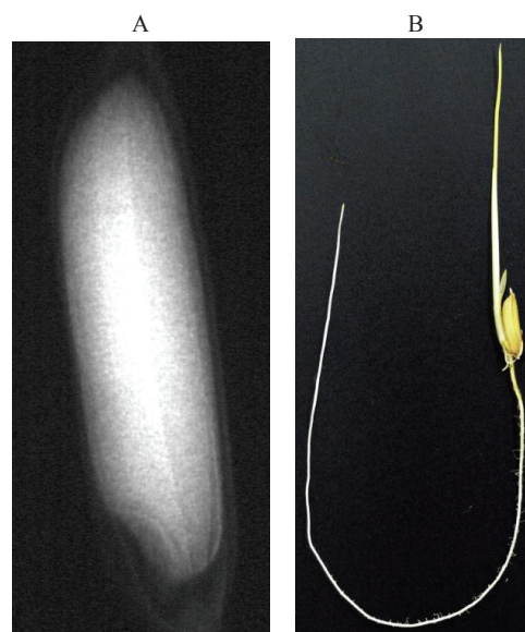
Figure 3. Cultivar IRGA 417, X-Ray of seed without any visible damage (A), normal seedling (B).

Figures 3 to 5 illustrate the levels of fissures, and the seedlings and ungerminated seeds produced by both cultivars as a result of stationary drying at different temperatures. Figure 3 shows that seed 16 from the IRGA 417 cultivar, dried at 32 °C, did not show a visible fissure (ranked 1) and produced a normal seedling. Seeds classified as 1 can also produce normal weak or abnormal seedlings due to physiological or metabolic damage, since the drying temperatures can damage vegetable tissues. This damage causes cell membrane disintegration and protein breakdown (Daniell et al., 1969). The physiological damage can also cause changes in sub-cellular systems, including the chromosomes (Roberts, 1981).