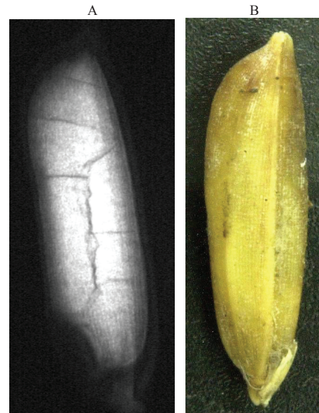
Figure 5. Cultivar IRGA 420, X-Ray of seed with severe damage (A), dead seed (B).

abnormal) and dead seeds, at the end of the germination test. This represents a good alternative for evaluating heat damage, as has been shown for mechanical or insect damage in the seeds of corn, soybeans, tree species (Cicero et al., 1998, Carvalho et al., 1999b, Cicero and Banzatto Junior, 2003 and Oliveira et al., 2003).