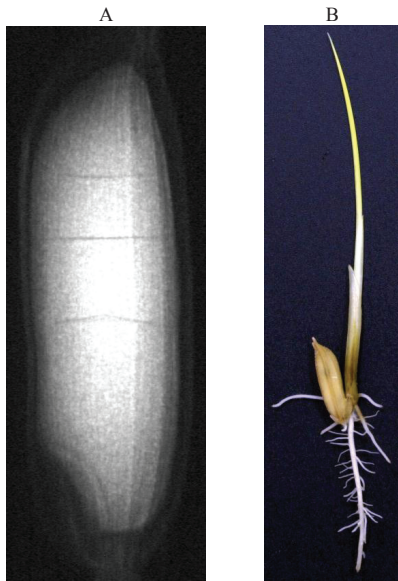
Figure 4. Cultivar IRGA 417, X-Ray of seed with non-severe damage (A), abnormal seedling, with the root system poorly developed, being disproportional to the total seedling size (B).

Figure 4 shows seed 39 of the IRGA 417 cultivar, dried at 38 °C, with non-severe fissures (classification 2). The fissures did not reach the embryo and permitted germination but they did affect root growth, resulting in an abnormal seedling. Level 2 damage can result in weak, normal seedlings, with retarded growth during the germination test.