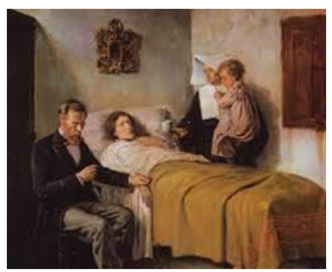
Figure 1 - Painting "Science and Charity", 1897, by Pablo Picasso. Oil on carvas, 197 x 249cm. Barcelona; Picasso Museum.

(Figure 1). In this painting, one can infer a severely ill woman in the presence of a doctor, a nun, and a child – perhaps the ill woman's daughter. Ariès<sup>(5)</sup> justifies that "until the 18<sup>th</sup> century there is no representation of a dying person's room without some children".