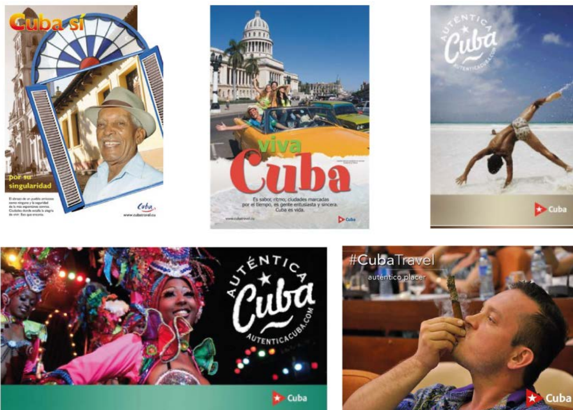
Figure 4 - Representation of social incentives in campaigns