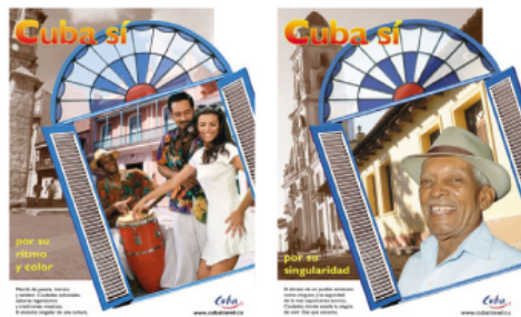
CUBA SÍ (2002-2006)