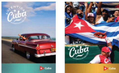
AUTÉNTICA CUBA (2010-2015)