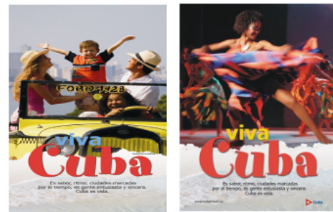
VIVA CUBA (2006-2010)