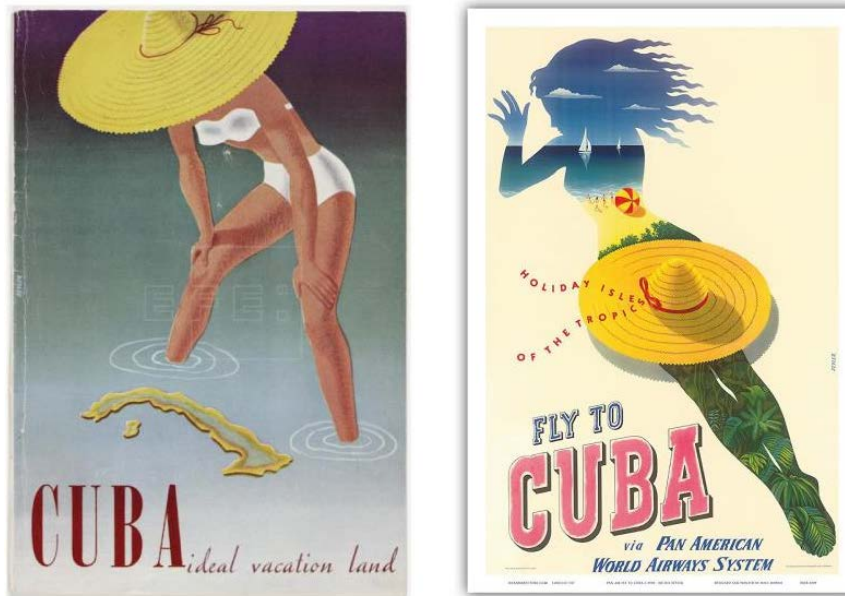
Figure 1 - Posters of the National Commission for the Promotion of Tourism in 1930 and 1940