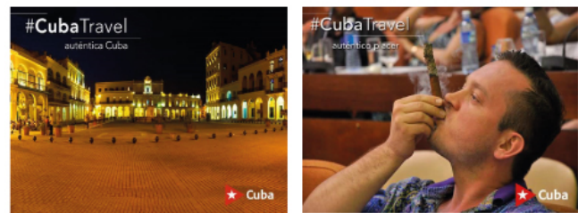
AUTÉNTICA CUBA (2015- ...)