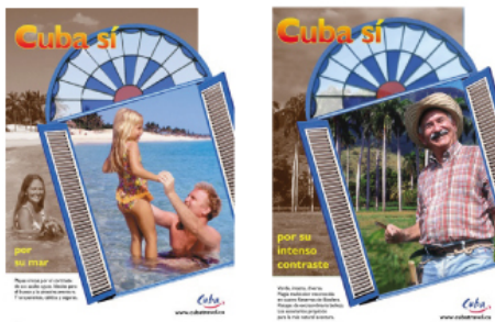
Figure 3 - Representation of natural attractions in campaigns