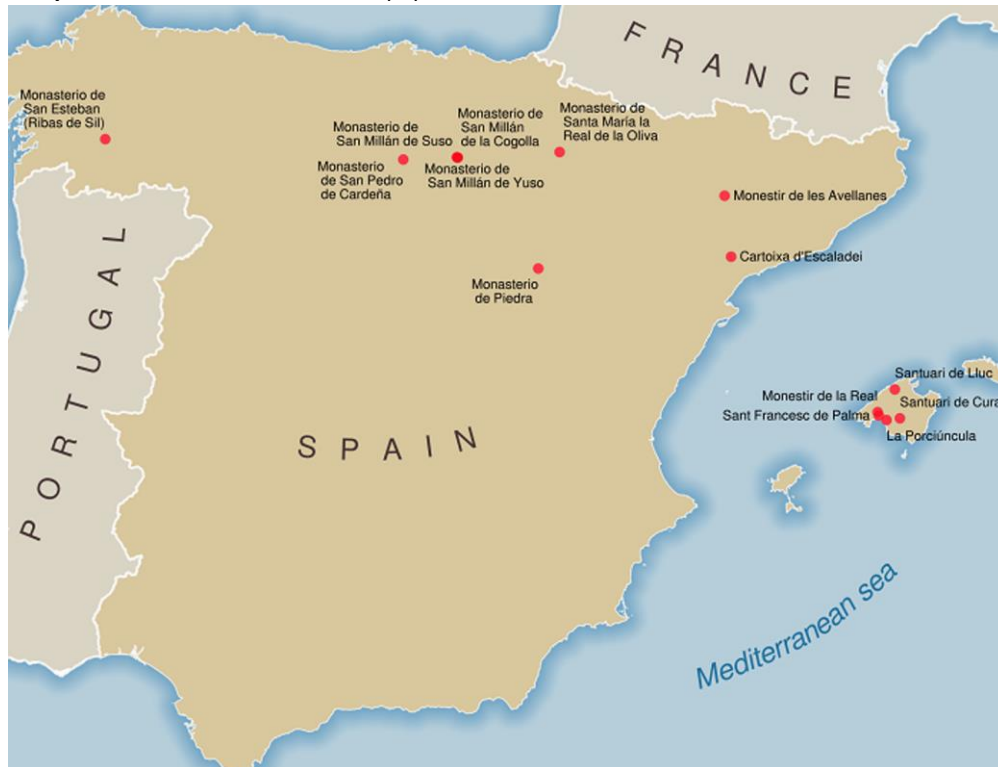
Map 1 - Monasteries listed in this paper