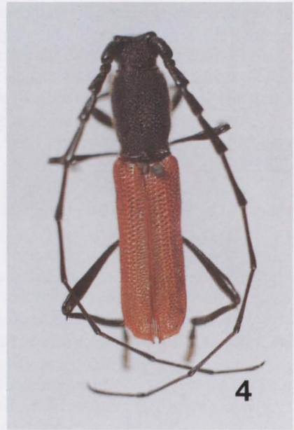
Figs 1-4. (1) Assycuera waterhousei , female sintrope; (2) A. rubella (Bates), male; (3) A. macrotela , male; (4) A. scabricollis , male.