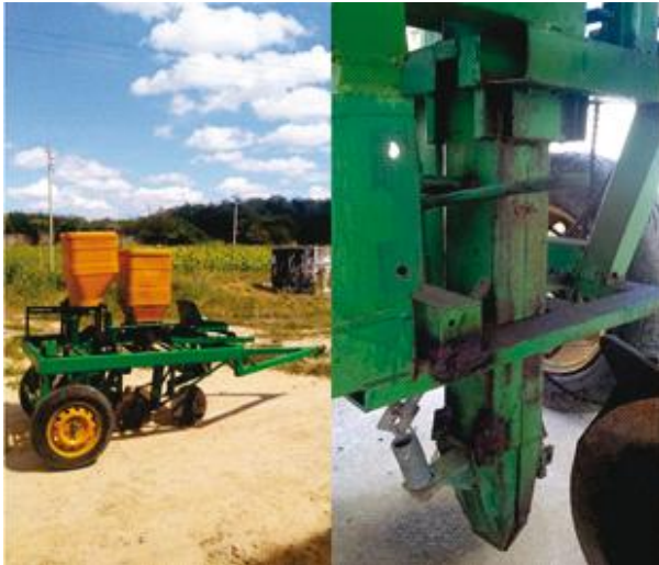
Figure 1 - Prototype of the punch seeder with the punch system for depositing the seeds

The wheel slip index of the seeder was measured following the methodology recommended by Mialhe (1996), counting the number of turns made by the wheel of the prototype seeder over a distance of 40 metres. The slip index of the seeder was determined from Equation 1.