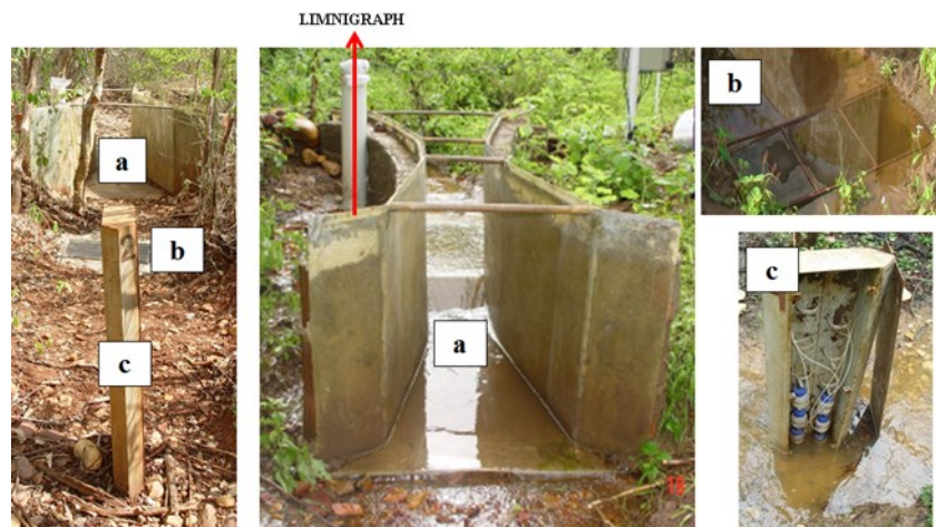
Figure 2. Parshall flume (a), pit to collect dragged sediments (b) and tower to collect suspended sediments (c).

The monitoring of the sediment production upstream in the flume was performed with 180-liter pits collecting dragged sediment in the river course and a tower for collect suspended sediments (Figure 2 b and c).