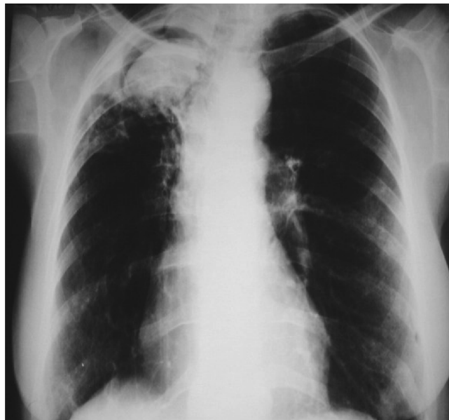
Figure 1 - Right cavity with great fungal ball.

All cavernostomies were performed under general anesthesia. Eleven patients used an endotracheal double-lumen tube, and six, single-lumen. In three patients cavernostomy was held during massive hemoptysis. In 14, a longitudinal incision was made in the midaxillary region, approximately 4.5cm long. In one patient, the access was made in the third intercostal space on the left midclavicular line; and in two patients the access was performed in the interscapular region, one in the third intercostal space on the right and the other in the sixth intercostal space. All individuals had pleuropulmonary adhesions. In 14 patients, the incision planes were left wide open and the wound spontaneous closure occurred between the 30th and the 40th day after surgery. In three patients the skin was approximated to the edge of the cavity (marsupialization) with single stitches of absorbable sutures. In two, the closing