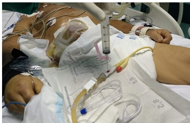
Figure 2. Insertion of the 2-way bladder catheter and sterile collector system used with a puncture in the collection portal. Submitted by: Bruno Souza Caldas.

Place the saline support next to the patient with a CVP ruler, with the zero mark at the level of the patient's midaxillary line.