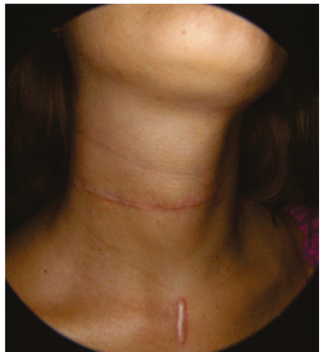
Figure 3. Late postoperative appearance.

Numerous incisions are normally used for the surgical approach, and most of them combine a transverse neck incision with a vertical one 7-9 . The vertical component is in opposition to the skin force lines, which increases the risk of scar contraction or keloid formation. Scarring retractions can lead to limitation of neck move-