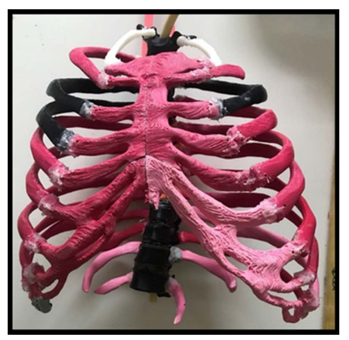
Figure 1. 3D printing of a thorax.

experimental, randomized, An and controlled study was carried out through the development of a 3D printing model that allowed the simulated training of the closed chest drainage procedure for medical students at the emergency room of Hospital do Trabalhador, Curitiba, Parana, Brazil. A 3D printing of the bony framework of a human thorax was made using a chest tomography, without the need of a funder and through a partnership with Federal Technological University of Parana (UTFPR) with a total cost of approximately 133 dollars (Figure 1). After printing the ribs, tests were performed with various materials that contributed to form the simulation of the thoracic cavity and pleura (Figure 2).