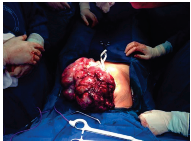
Figure 4. ETT in patient with large abdomino-pelvic mass.

The FIGO prognostic score did not prove to be a good predictor of surgical treatment and was considered inadequate for the evaluation of chemoresistant patients 26 .