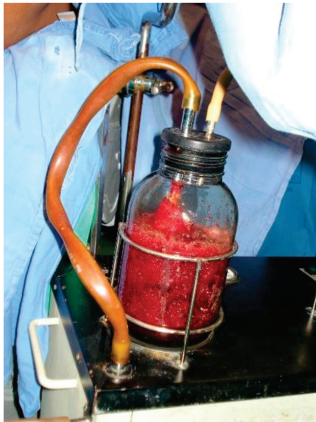
Figure 1. Uterine aspiration (electric).

Uterine vacuum aspiration is the procedure of choice for the uterine evacuation of patients with molar pregnancy, because it is safe, fast and effective (Figure 1). It can be performed by electrical aspiration or by intrauterine manual aspiration. For this, the cervical