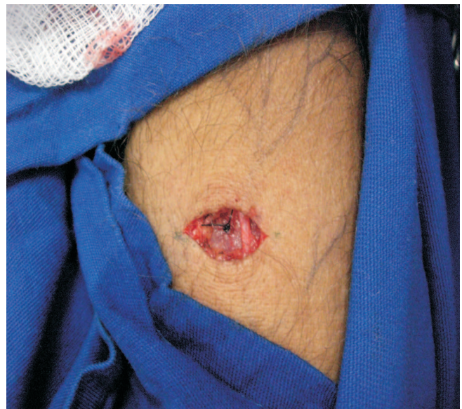
Figure 3 - Implant in a single site.