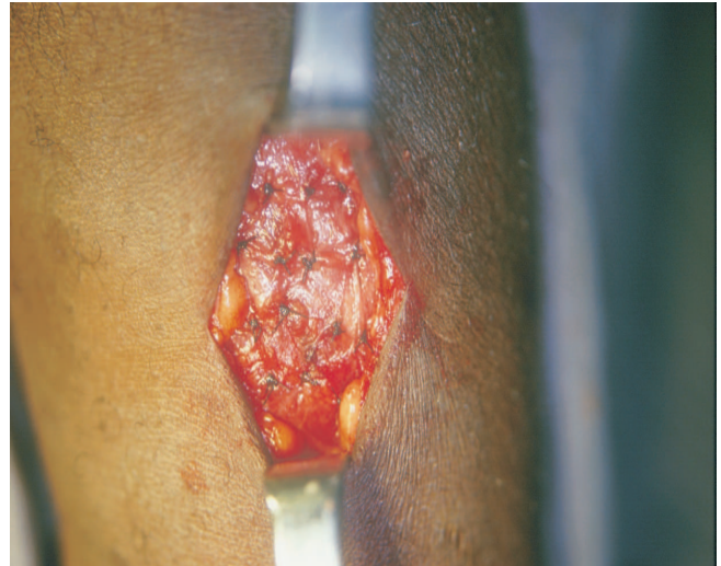
Figure 1 - Implant with twenty sites.

Functional implant situation was classified according to the systemic levels of serum PTH obtained in the upper limb contralateral to the implant: Functional