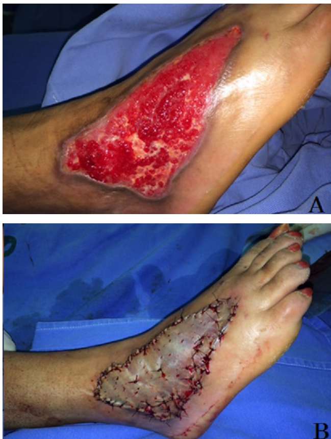
Figure 1. Loss of substance on the back of the foot: A. Preoperative; B. Partial skin graft.