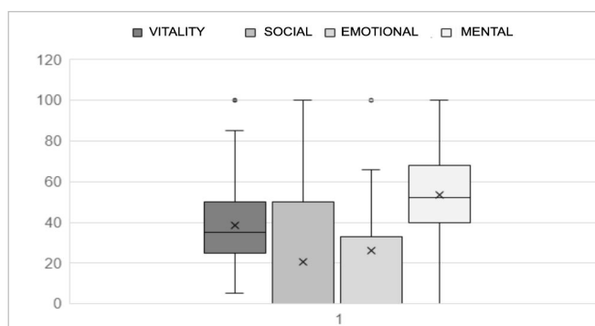
Figure 2. Graph representing the distribution and standard deviations of scores in the vitality, social aspects, limitation due to emotional aspects, and mental health domains, answered in the SF 36 questionnaire by patients undergoing pleural drainage for benign pleural effusion. Raw scale, no unit values.