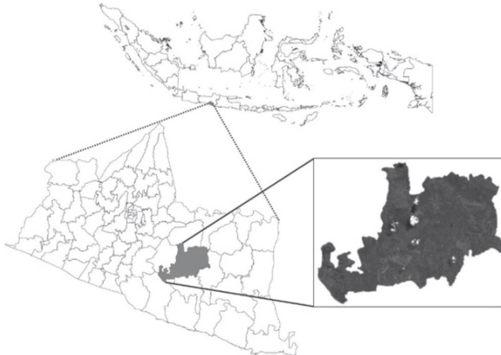
Figure 1: Geographical locations of the study area (latitude 7° 52' 59.5992" S to 7° 59' 41.1288" S and longitude 110° 26' 21.462"E to 110° 35' 7.4868" E)