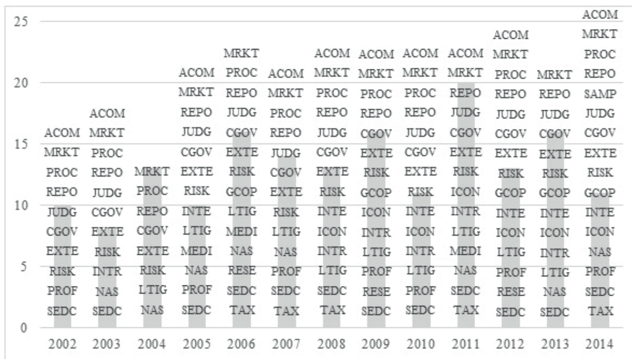
Figure 5 Production in volume (by theme) – Contemporary Accounting Research

Accounting Research had the same highlights over the years comprehending the themes (figures 4 and 5): audit market (MRKT), audit report & financial statement users (REPO), corporate governance (CGOV), external audit (EXTE), and fraud risk & audit risk (RISK).