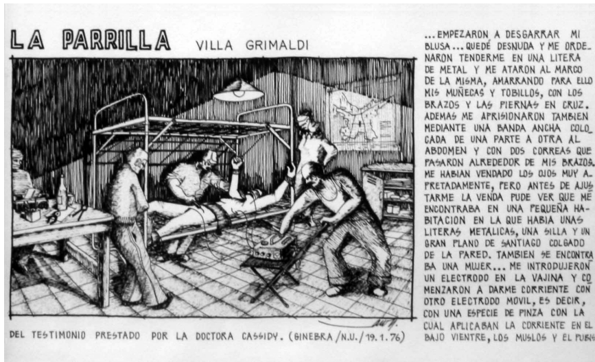
FIGURE 2 – THE GRILL

Drawn by prisoner Miguel Lawner (1976).