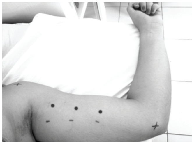
Figure 1 – Points to evaluate superficial sensitivity on the dermatome of intercostobrachial sensory nerve (ICBN).

To evaluate SS, patients remained with their eyes closed and in the supine position, with the shoulder abducted 90 degrees, external rotation and with the forearm flexed in 90 degrees. The monofilament was perpendicularly applied to skin, mildly pressing until the initial filament curvature, and then it was removed. Measure was duplicated and incremental with regard to pressure, considering as skin sensory threshold the filament where patients reported feeling the touch. Measure was repeated twice